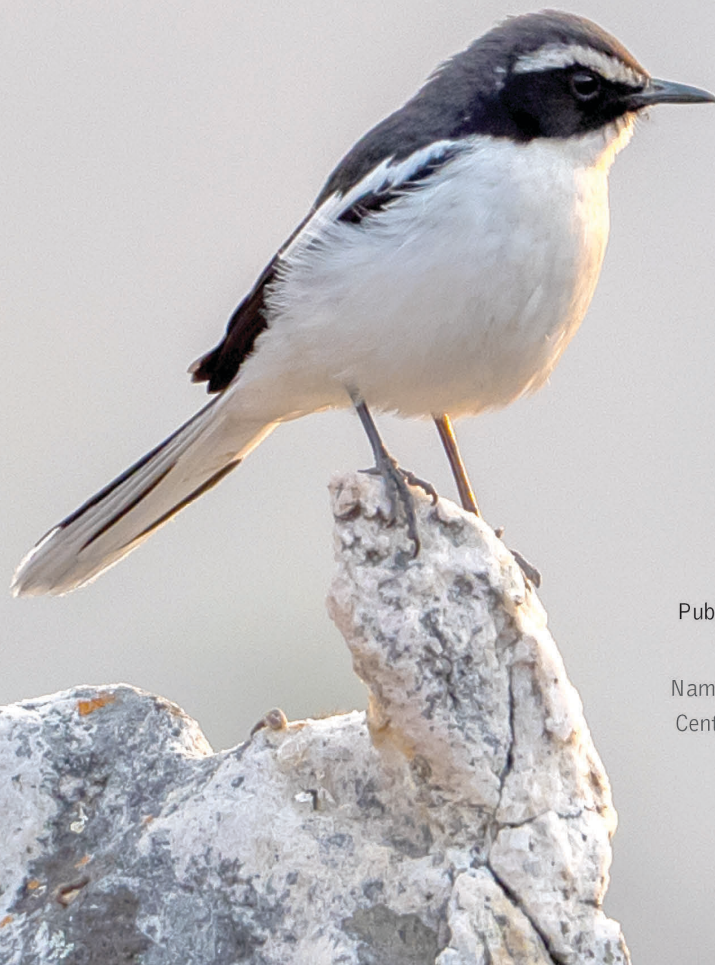
Angola Cave-Chat Xenocopsychus ansorgei