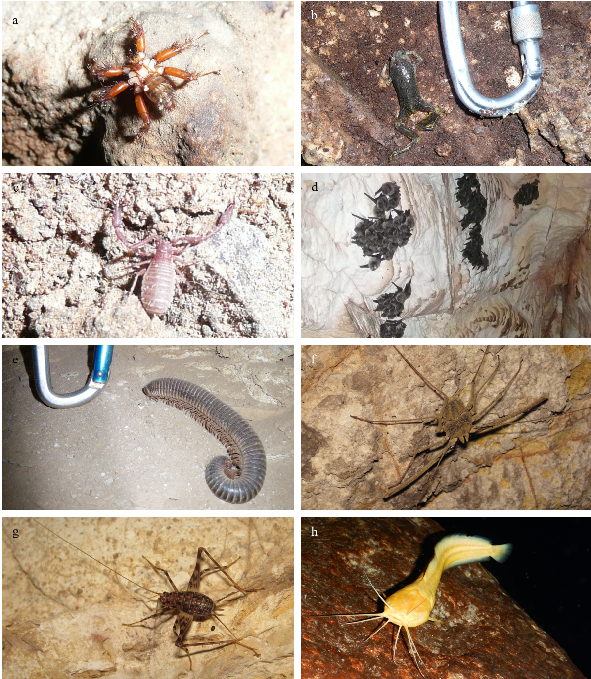
Figure 3: A selection of animals found in caves in Namibia and Angola. a) Nycteribiidae sp., bat fly found near horseshoe bat roosting deep in the caves of Senhora do Monte (photo: Renato Serôdio, 2010); b) Amietia angolensis observed at Algar do Tchivinguiro (photo: Renato Serôdio, 2010); c) Chernetid pseudoscorpions found at the Humpata caves (photo: Renato Serôdio, 2010); d) Groups of horseshoe bats roosting in the pseudo-karst fissures Senhora do Monte (photo: Renato Serôdio, 2010); e) Giant African millipede, Cangalongue Cave (photo: Rui Francisco, 2010); f) Amblypigi at Sumidouro Candimba Cocufima, Tchivinguiro (photo: Rui Francisco, 2010); g) Cricket (Grillidae) at Sumidouro Nandimba Cocufima (photo: Rui Francisco, 2010); h) Clarias cavernicola cave catfish in Aigamas cave, Namibia (photo: Francois Jacobs).

REPTILIA: Testudines, Pelomedusidae: Pelusios spp. (turtles) have been observed in caves near water bodies or associated springs. Colubridae: Boaedon angolensis , the Angolan house snake, has been observed inside and in the vicinity of the caves. Agamidae: Agama planiceps is found in rocky areas and cliffs in the vicinity of caves. Scincidae: