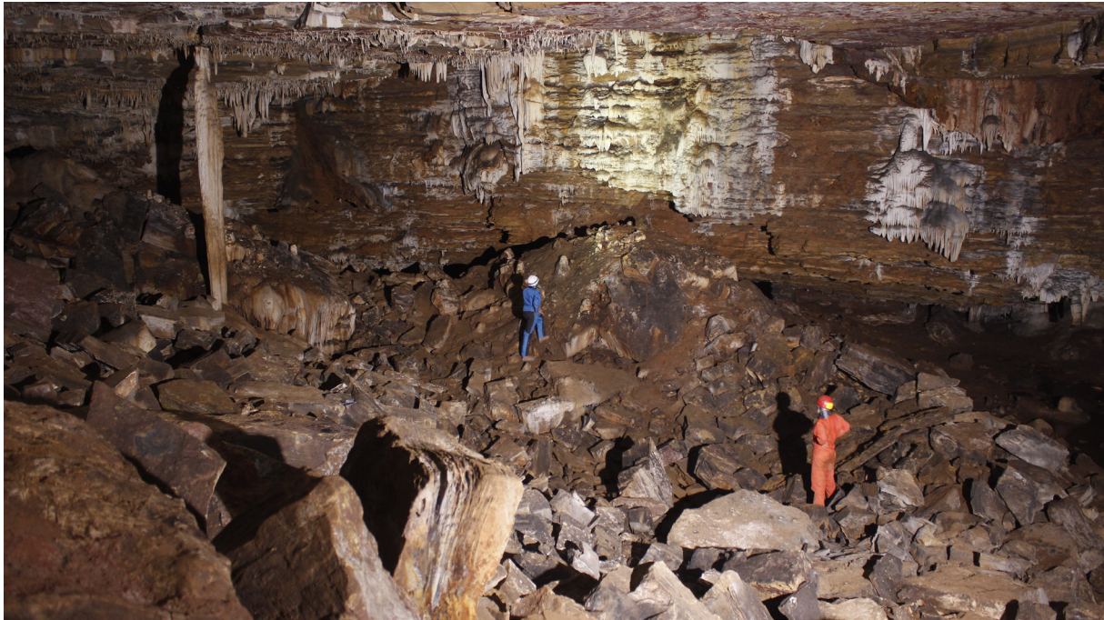
Figure 2: The main chamber of Tchivinguiro Cave, with a column on the left. Photo: Rui Francisco, 2019.

many chimneys and narrow sinkholes give access to the subterranean chambers. These chimneys are frequently obscured by thick thorn bushes and the channels are choked by pink-red muds and bedrock debris. Inside the cave, the environment is warm with temperatures ranging 25–28°C, with relative humidity over 90%. The chambers are covered with the boulders of roof spall. Many stalagmites cover the upper surface of these blocks. A few speleothem columns are also present, some exceeding 4 m in height (Figure 2). The underground network surveyed at Tchivinguiro extends for about 1 km but it is likely to be longer, with a few shafts connecting to the outside. The freshwater reservoir emerges at Nandimba spring along the western foothills of the escarpment where it is used to irrigate crops. Crabs and catfish are commonly observed inside the cave pools but the aquatic fauna of Tchivinguiro cannot be regarded as stygobiotic because the pools are connected to surface pools. Areas of suction were detected and indicate pipes and chimneys to other lower bodies of water which suggest that different microenvironments and biota may be present at deeper levels.