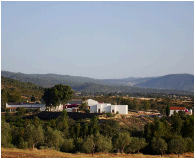
Fig. 2. Los Portales Community.