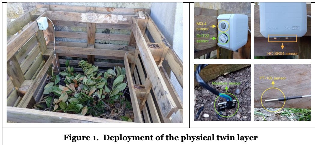
Figure 1 portrays a real structure incorporating sensors and communication devices. Among the multiple possibilities for designing composting units, the team decided to use local (natural) materials at this stage (top cover structure removed to show the interior details).

Figure 1 shows the composting bin structure.