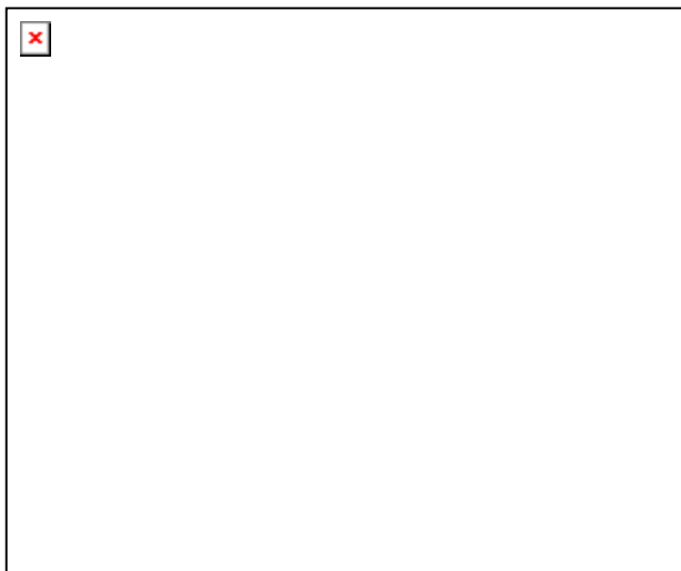
Figure 5 – An example of the «Molecularium», iodine sublimation on line.

These simulations refer to thermodynamical concepts (pressure and temperature), physical states of matter aggregation (solids, liquids and gases) and transitions between them. They are going to be linked in a coherent way to stereoscopic video images of real objects (see http://www.science.widener.edu/molecule3d/ ), in order to smooth the transition from the macroscopic to the microscopic worlds.