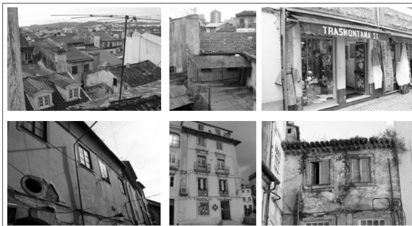
Figure 1: Historical Coimbra city centre images

After defining the main areas involved in the assessment of sustainability, discussed earlier, it were defined the analysis' parameters for each one of them, based on the characteristics of the historical areas of portuguese cities, the sustainability principles and the strategies outlined by the Urban Rehabilitation Corporations that exist, such as in Lisbon, Porto and Coimbra. The particularity of these urban areas requires detailed knowledge of its evolution, the constraints and potential impacts of their specificities. While the physical conditions of buildings, the age of residents, the conditions of infrastructure and urban space constraints are important, the historical and cultural value, the urban memory urban, the economic activities and the built environment are key factors that characterize the enormous potential of these areas. Figure 1 shows some images of the historic area of Coimbra's downtown.