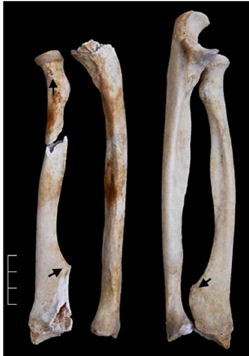
Figure 2. Right and left forearm (anterior view), where it can be observed the osteochondromas on both radii (arrows).