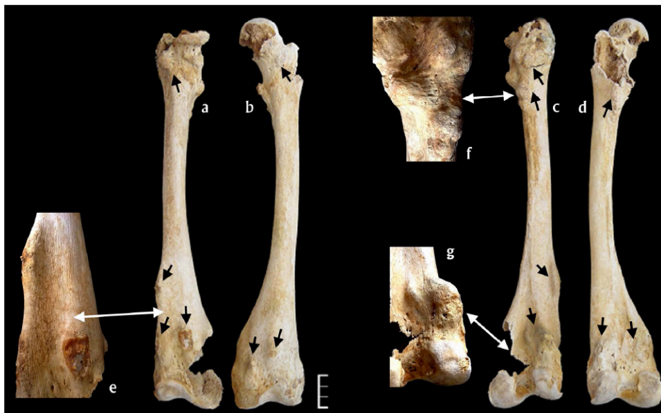
Figure 3. Right [(a) anterior and (c) posterior views] and left [(b) anterior and (d) posterior views] femora, exhibiting osteochondromas on multiple locations (arrows). Close up of the affected areas: (e) distal and anterior osteochondromas; (f) proximal and posterior osteochondromas and (g) distal and posterior osteochondromas.