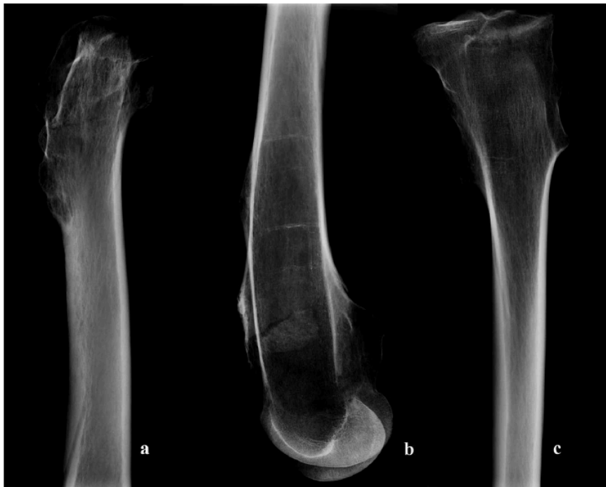
Figure 5. Radiographic images of the proximal (a) and distal (b) right femur and proximal right tibia (c) (Parameters: 62 Kv, 8 mA).