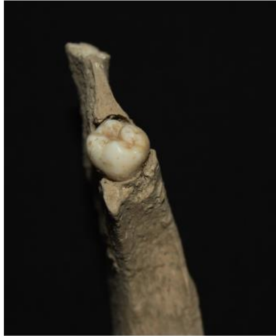
Fig. 3. Close up of the ectopic molar in the right posterior margin of the coronoid process.