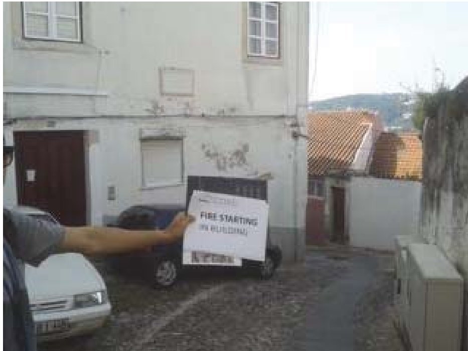
Figure 3. Assistant in the simulation exercise showing a poster that indicates an event supposed to be occurring