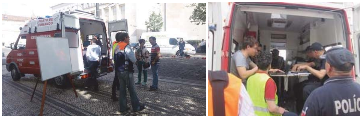
Figure 4. The site command centre

The alarm call was made at 10am (real time) through the European common emergency telephone number (112). The defined mechanisms to start the means of assistance were followed and the Professional Corporation of fire-fighters was contacted. Due to the seriousness of the occurrence, a site command centre (SCC) was set up for the control of all fire brigade operations (Figure 4). Such SCC consisted of a senior fire officer (who played the role of site commander), two fire-fighters (the site commander’s assistants), and three crowdsourced information operators (all three, training school participants) – two of them received and processed information reported by volunteers using the KoBo application and one operator dealt with the data collected with the Hydra application. The process of “information reception, information processing, and actions” was operated at SCC following a “triangular” structure illustrated in Figure 5.