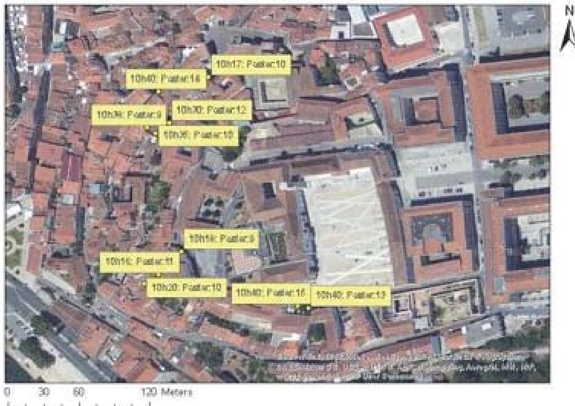
Figure 2. Example of map used by one group of volunteers

To organise the information that was supposed to be observed by each group of volunteers and then to be sent to the Civil Protection Authority, an orientation map (Figure 2) was given to student assistants. One assistant accompanied each group, with the indication of the route that each group should follow. Some spots were highlighted in the orientation map where particular events were supposed to be observed and also the time they should be reported. A numbered poster was supposed to be shown to the volunteers at a particular time and location, in order to simulate a real event. Figure 2 shows one of the maps used and Figure 3 a picture of an event indication that volunteers were supposed to report. Besides the events indicated in the posters, all groups were free to report whatever other events they may have observed and considered of interest.