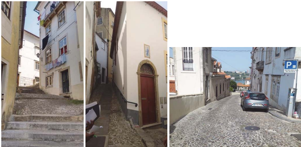
Figure 1. Images of the exercise location (the “Alta” neighbourhood in Coimbra)

Brigades, two police forces, namely the Police for Public Security (PSP) and the Municipal Police, and the safety office of UC.