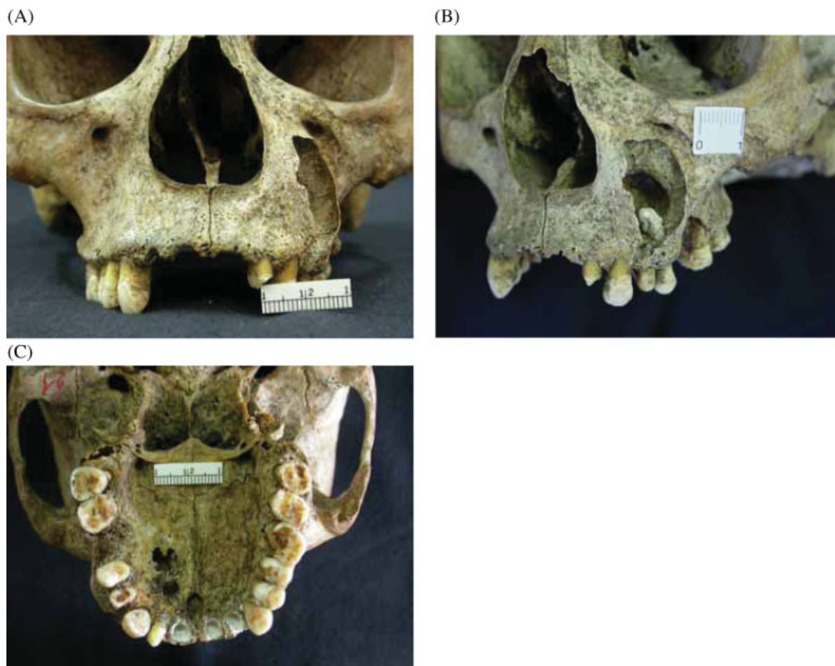
Figure 3. Skull 21 showing a large periapical periodontal cyst. (A) Anterior view of the skull showing the bony expansion of the left maxilla. (B) Oblique lateral view showing the extent of bone loss of the maxilla and the root of the second left premolar protruding into the bony cavity with no sign of resorption, together with hypercementosis at the apical region of the root. (C) Palatal expansion of the cyst leading to bone destruction. (This is an example of a late stage apical periodontal cyst and relates to Figure 4 stage E and beyond). This figure is available in colour online at www.interscience.wiley.com/journal/oa .

There are no signs of loosening of teeth adjacent to the above-mentioned teeth.