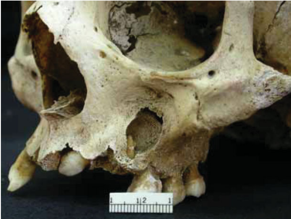
Figure 2. Lateral view of the left maxilla of skull 90, showing the bone lesion together with the root of the offending second premolar protruding into the bony cavity. The first premolar was lost ante-mortem and the canine is impacted. (This is an example of a moderate size apical periodontal cyst and relates to stages D and E in Figure 4). This figure is available in colour online at www.interscience.wiley.com/journal/oa .

right first molar. In general, she had good periodontal condition with no signs of gross vertical or horizontal alveolar crestal bone destruction.