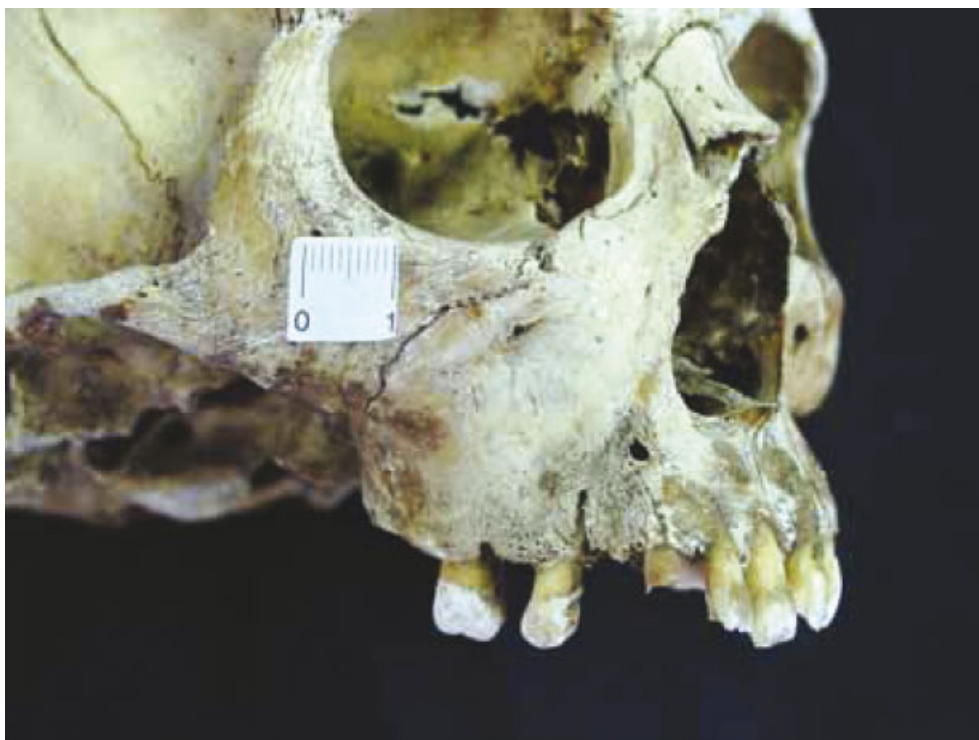
Figure 1. Oblique lateral view of skull 37 showing the right maxilla. The opening on the facial surface of the alveolar bone in relation to the apex of the septic root of the canine is seen (2 × 2 mm). Surrounding the aperture there are signs of bone remodelling. (This is an example of a periapical granuloma, relating to stages A and B in Figure 4). This figure is available in colour online at www.interscience.wiley.com/journal/oa .