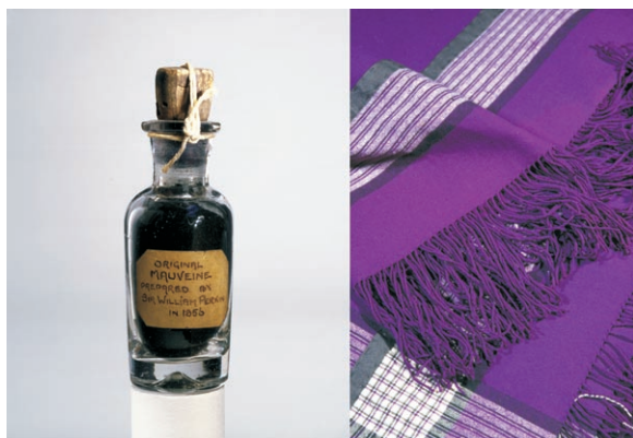
Figure 1. The Science Museum's "Original Sample" of mauve (left). In this work, it is shown that this sample was obtained by a second synthetic process developed by Perkin, and therefore it cannot be considered to be the result of Perkin's pioneer synthesis. The result of the original process of 1856–7 may still exist in three textile samples; the shawl shown on the right, corresponding to the analysed Science Museum F6 fabric, is one of these samples, see text.

light-induced and pollution-induced fading and to washing. Mauve, as a successful dye, fulfilled all these criteria.