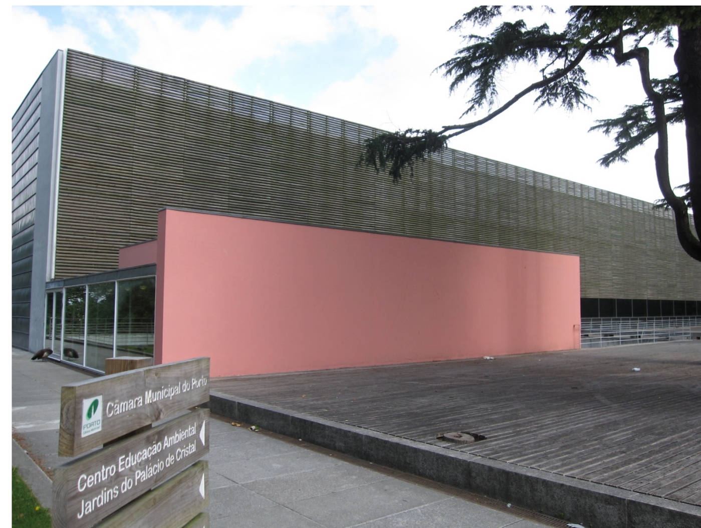
Figure 2. The main façade of the Almeida Garrett Library.