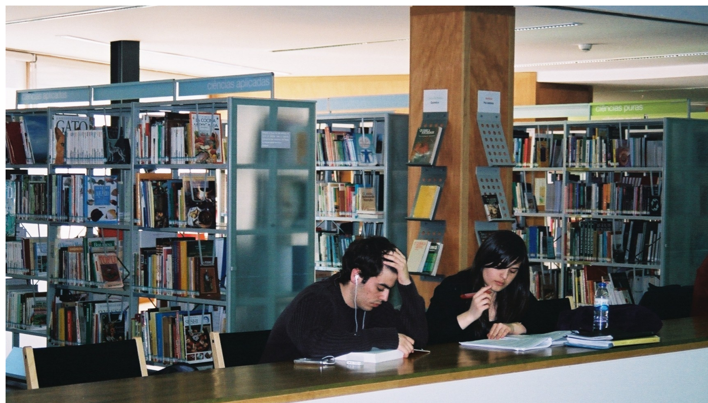
Figure 5. Studying in the mezzanine.