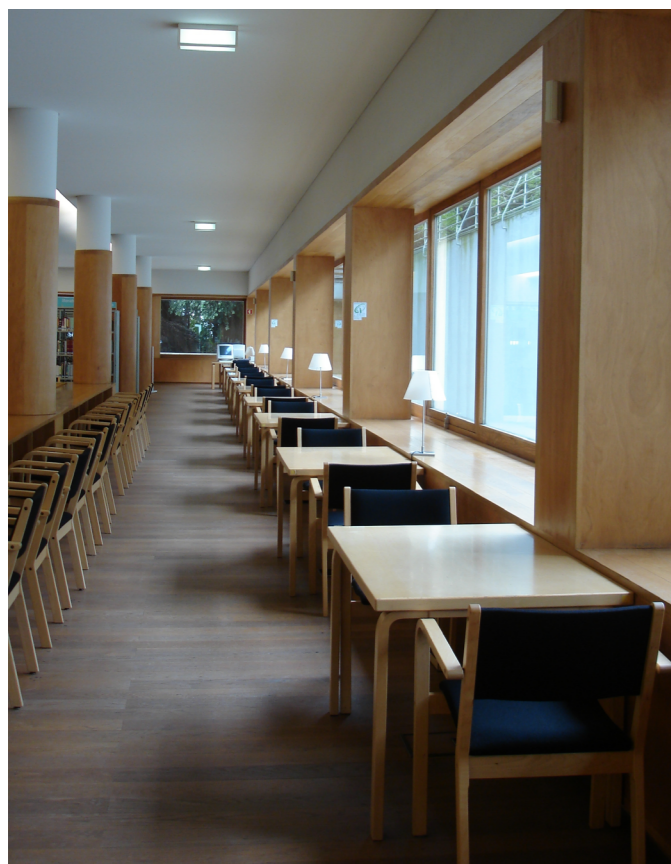
Figure 3. The inner face of the main façade to the right, the park trees may be seen at the end.