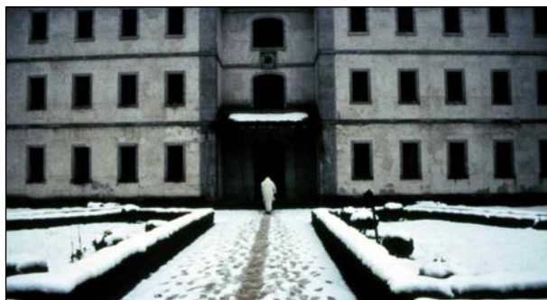
Die große Stille.

There is already a fecund interrelationship between philosophy and film studies. I am thinking particularly of the writings on film by Gilles Deleuze and Stanley Cavell. As far as I know, there is nothing of comparable sophistication on religion and cinema, unless it would be the yet unpublished work of Jeffrey Stout.