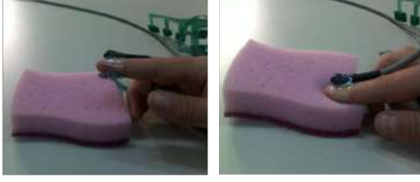
Figure 2: Active exploration of the novel object Object_1 using a motion tracker sensor Polhemus Liberty and a tactile distributed sensing array (4x4) Tekscan Grip system.