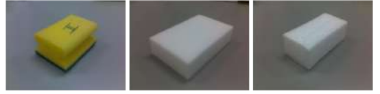
Figure 1: Set of the 3 reference materials, Material_1 , Material_2 and Material_3 , with different softness characteristics.

In this first processing stage, for each volumetric column of the volumetric representation, if we consider \vartheta_U as the set of